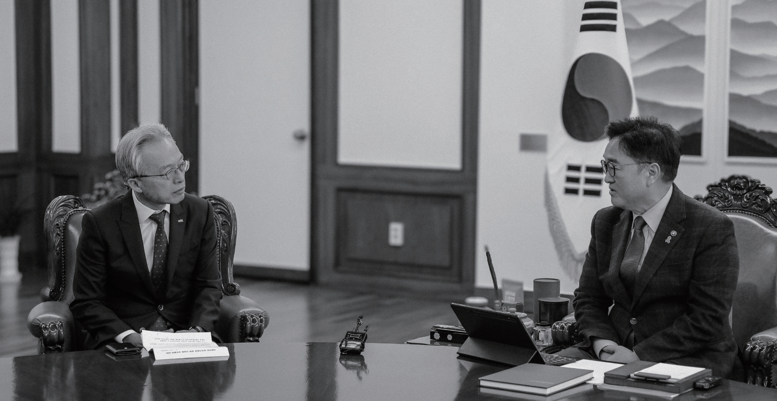
MME roundtable with national assembly speaker Woo Won-shik Mar. 7, 2025